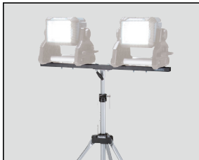
TRIPOD LIGHT STAND (GM00002073)