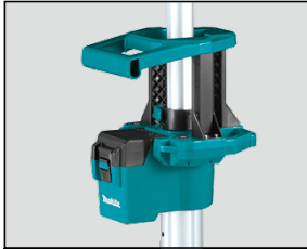
ACCESSIBLE BATTERY COMPARTMENT